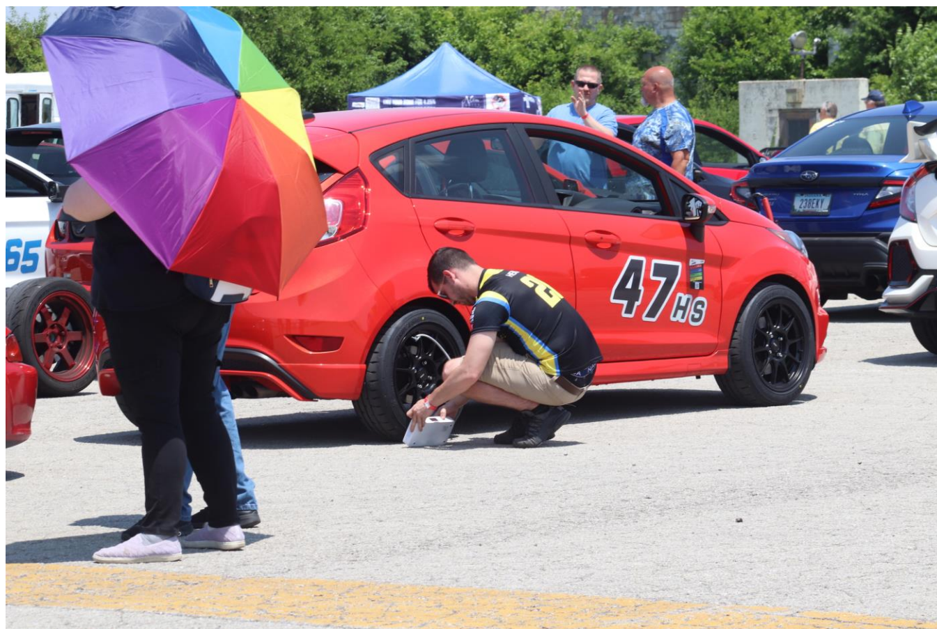
The grid is a busy place at one of the Indy Region Solos