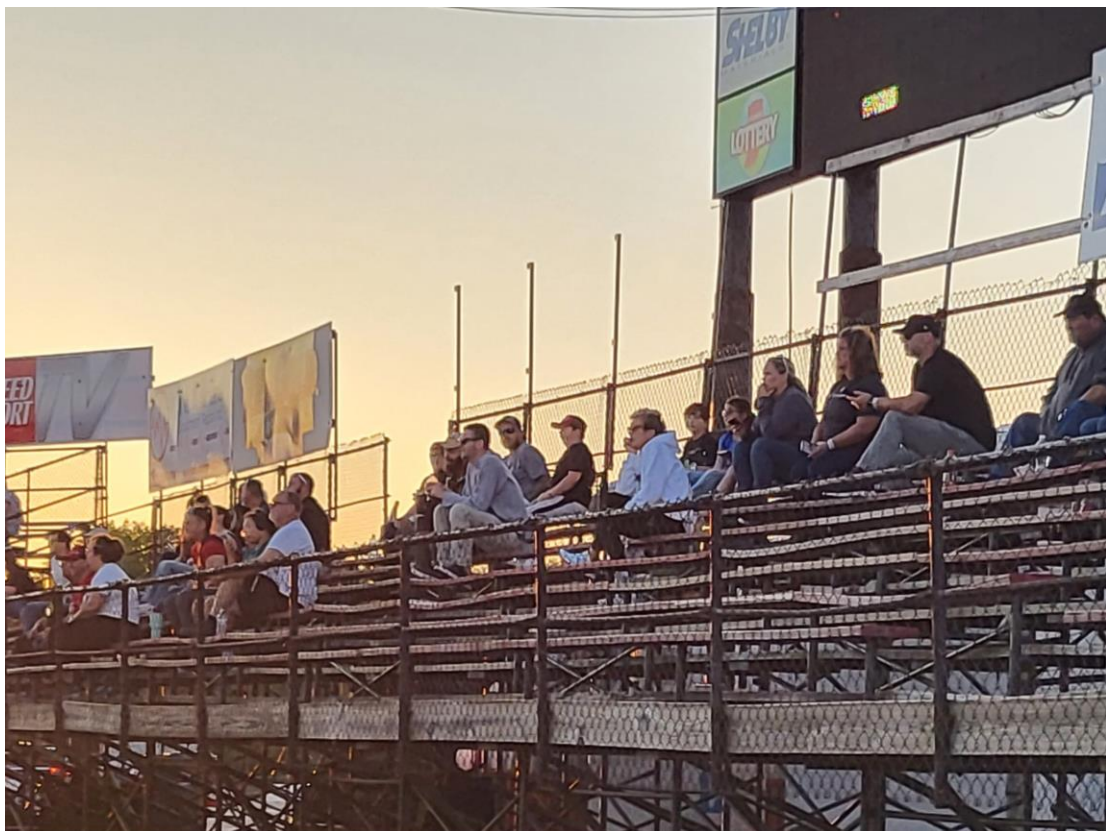
Spectators at the Solo Under the Lights, "Friday Night Madness"