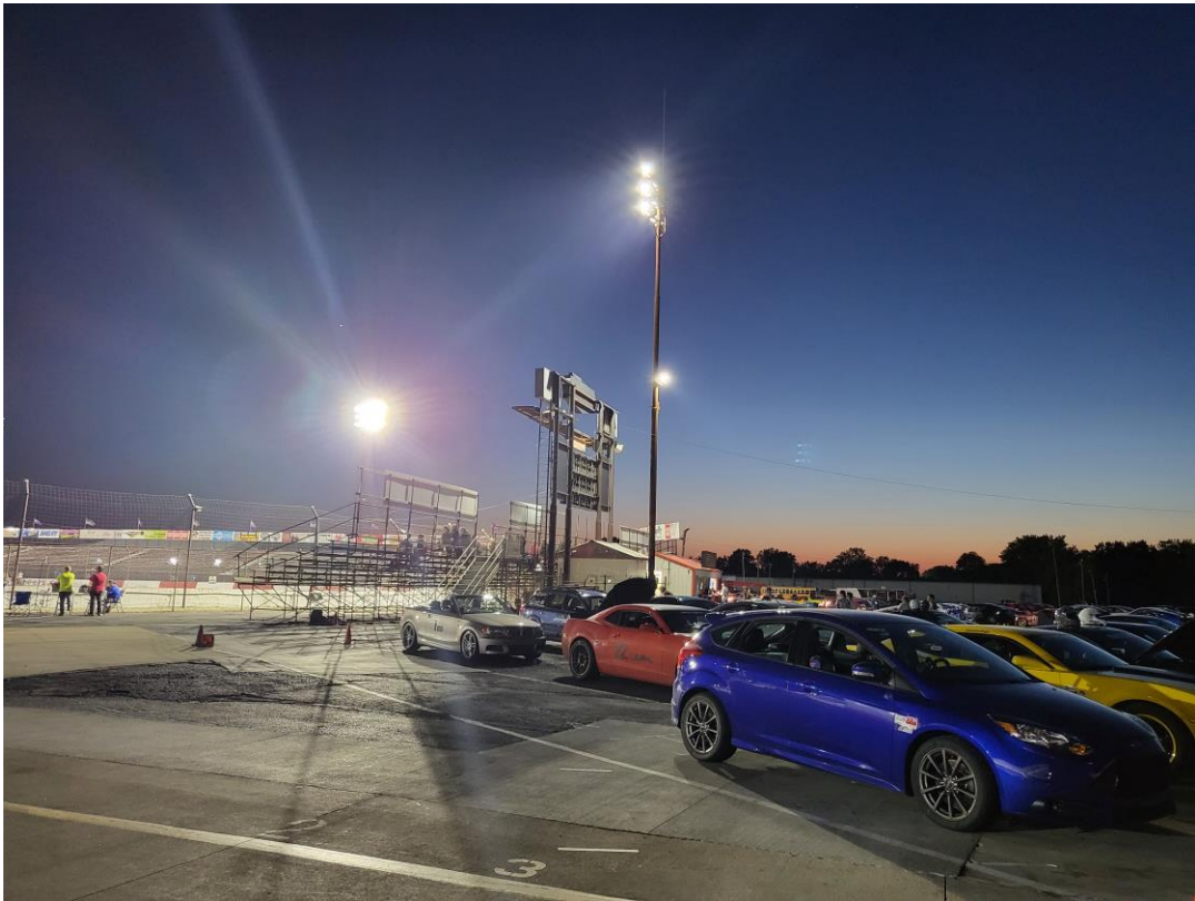
Sept. 15 th Solo Under the Lights, "Friday Night Madness"