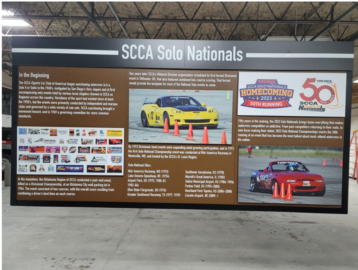
The backdrop for the display at the “Museum of American Speed” in Lincoln, NE for the 50 th running of Solo Nationals.