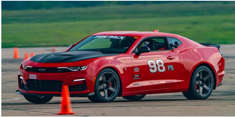
Dennis Bay running FS at the 2023 Solo Nationals